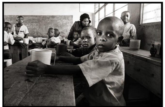
Lunch break at school in Mahama Camp — the largest refugee camp in Rwanda.

Find a peek into Mahama refugee camp where over 60,000 refugees are benefiting from WFP assistance here .