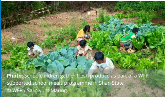
Photo: Schoolchildren gather fresh produce as part of a WFP-supported school meals programme in Shan State © WFP / Sai Nyunt Maung