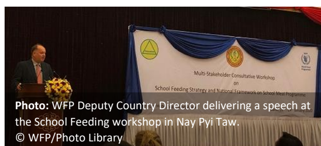
Photo: WFP Deputy Country Director delivering a speech at the School Feeding workshop in Nay Pyi Taw.

Currently, WFP is finalizing the strategy and aims to launch it in March. Meanwhile, WFP supports the establishment of school gardens and school kitchens through its asset creation and livelihood programme. By engaging in the preparation of school meals and the nurturing of school gardens, schoolchildren and their communities can learn basic agricultural skills to grow a variety of nutritious food while also learning about the importance of nutrition.