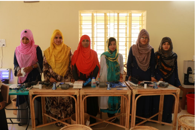
Volunteers in Camp 4: "Our suggestion is to give jute bags to the beneficiaries. It's less fragile and they will be able to use it for a long time"