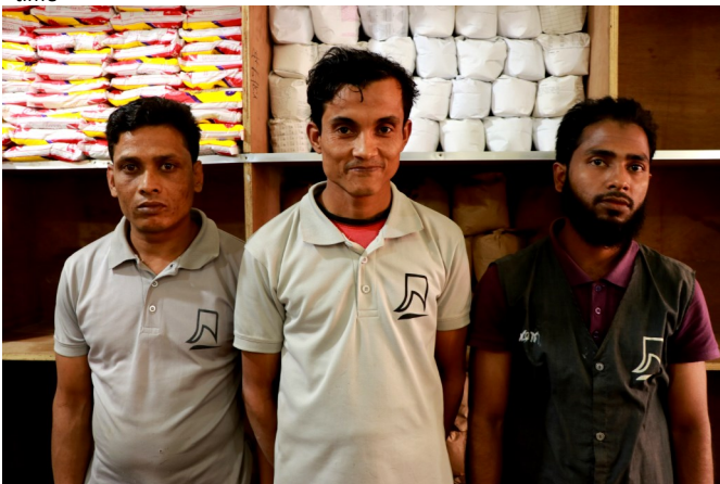
Retail staff at Camp D5 outlet: "We are working round the clock to sensitize the beneficiaries on the positive impact of using paper bags. I think gradually they are understanding the benefits."