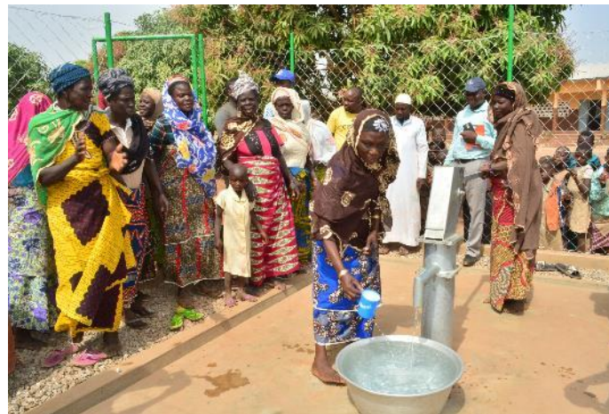
Inauguration with the community of a water pump built by EDUCO within the Public Primary School of KPARO in the Borgou department, on 22 January 2020.