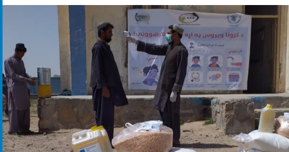
An aid worker at a food distribution site in Kandahar checks the temperature of a WFP beneficiary.