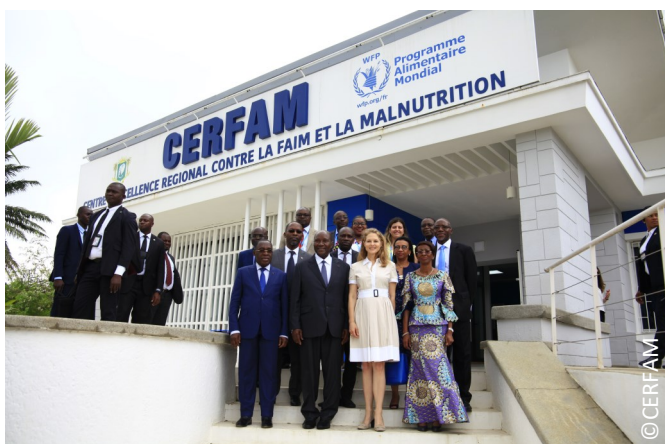
The Princess of Jordan, Sarah Zeid, visited CERFAM on July 20, 2019 , in the company of the Vice-President of Cote d'Ivoire and other authorities. This visit was part of a tour of the Sahel countries, with a view to raising awareness of the situation in this area and the contribution that CERFAM could make in promoting innovative solutions and good practices against hunger and malnutrition.