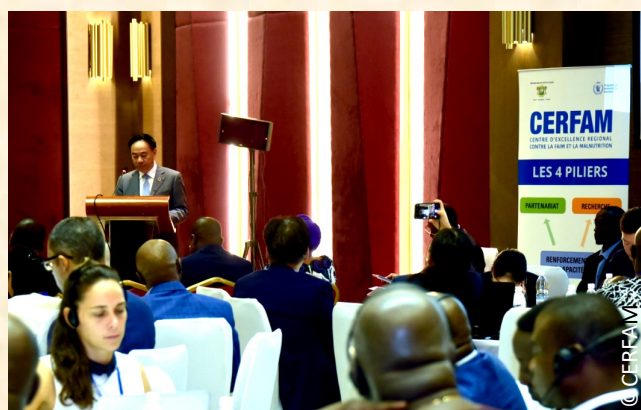
Mr. Wu Lifeng, Director of the Department of International Cooperation of the Chinese Ministry of Agriculture and Rural Affairs:

"...At a time of general mobilization to combat food losses and waste, there is an urgent need to transform food systems to make them more effective and efficient. Africa is full of innovative experiences that deserve to be harnessed, and better access to information and expertise are the cornerstones for the continent".