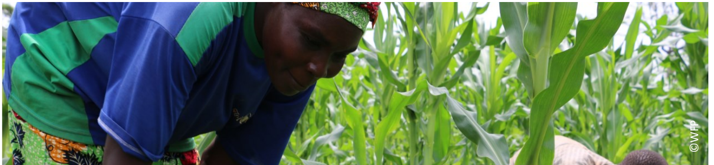
For 2020, CERFAM will focus on identifying and documenting good practices against hunger and malnutrition in Africa