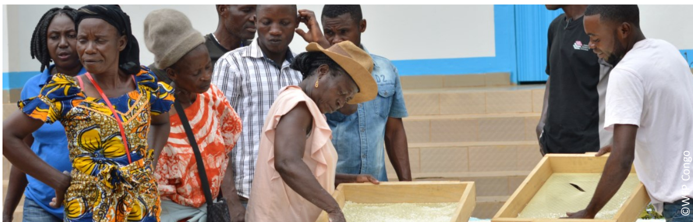
The beneficiaries of the Congo carefully observe the manufacture of the attiéké with the experts from the Côte d'Ivoire

Following a request from WFP Congo, CERFAM has facilitated institutional and technical cooperation between the governments of Congo, Côte d'Ivoire and Benin aimed to optimize the cassava value chain by sharing on the ground Ivorian and Beninese experience and know-how to benefit Congolese smallholder farmers.