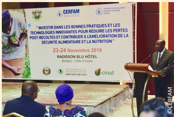
Daniel Kablan Duncan, vice-president of the Republic of Côte d'Ivoire:

"... In Côte d'Ivoire, data indicate a reduction in the prevalence of moderate food insecurity to 10.8% in 2018 and the elimination of the severe form of food insecurity, the reduction in the prevalence of stunting in children under 5 from 29.8% in 2012 to 21.6% in 2016. I reiterate Côte d'Ivoire's commitment to fight hunger and malnutrition in collaboration with the countries of the region, in order to make progress towards the implementation of the Malabo Declaration of the African Union by 2025 and the 2030 Agenda of the United Nations related to the Sustainable Development Goals (SDGs)".