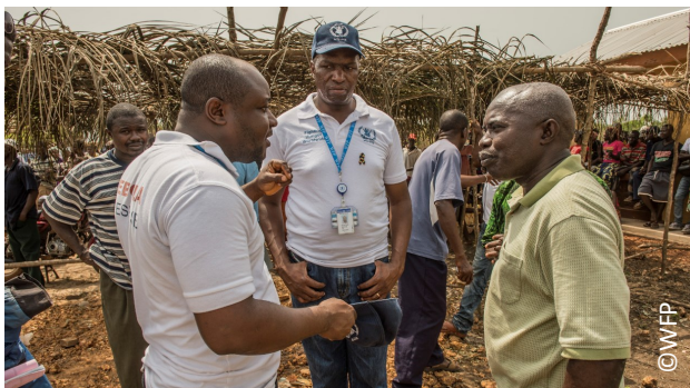
Discussions focused on sharing agricultural experiences, approaches and innovations

From October 28 to November 1, 2019, the German Agency for International Cooperation (GIZ) organized the Sector Network for Rural Development (SNRD) conference in Abidjan.