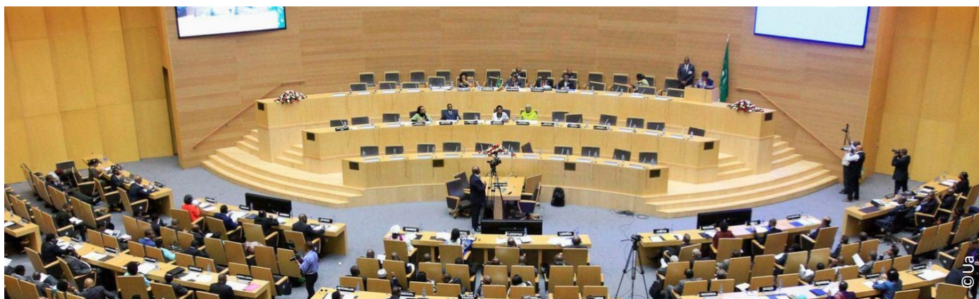
The AU has a post-harvest loss management strategy, developed in collaboration with partners.

In September 2019, CERFAM took part in the second All Africa Post-harvest Congress and Exhibition organized by the African Union Commission (AUC) which took place in Addis Ababa, Ethiopia.