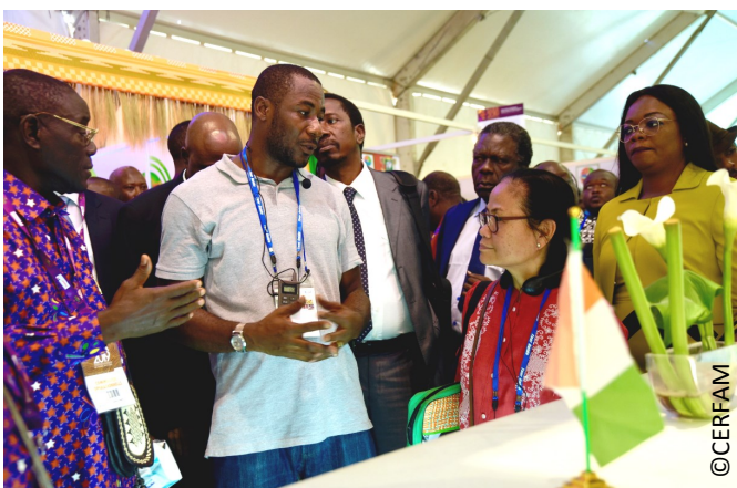
The various partners and actors involved in the research and implementation of innovative technologies, took advantage of a workshop organized in Abidjan by CERFAM, to visit the International Exhibition of Agriculture and Animal Resources of Abidjan (SARA 2019). They've discovered there productions, innovations and direct investment opportunities in the agricultural, animal, fishery and forestry sector of Cote d'Ivoire and the countries of the sub-region. The workshop was organized in collaboration with the government of Cote d'Ivoire and other partners, on the theme "Investing in good practices and innovative technologies to reduce post-harvest losses and help improve food security and nutrition". The workshop, which was held on 23 and 24 November 2019 , aimed to encourage discussions and the sharing of experiences between different actors in the agricultural sector.