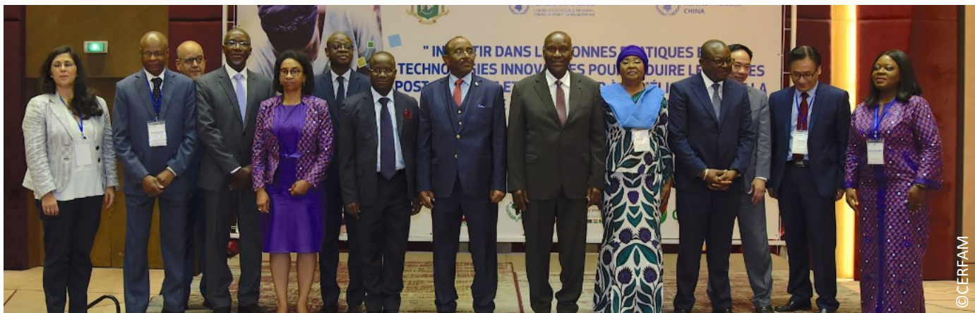
CERFAM brought together political authorities and more than 70 experts during the workshop on the fight against post-harvest losses in Africa

From cereals to vegetables, tubers and fruits, post-harvest losses represent a major issue in Africa and are estimated at 37% of the total production. At which stages do these losses occur? What are the solutions to address these challenges? These are some of the questions that CERFAM and its partners tried to address during a workshop held in Abidjan on 23rd and 24th November on the theme "Investing in good practices and innovative technologies to reduce post-harvest losses and help improve food security and nutrition."