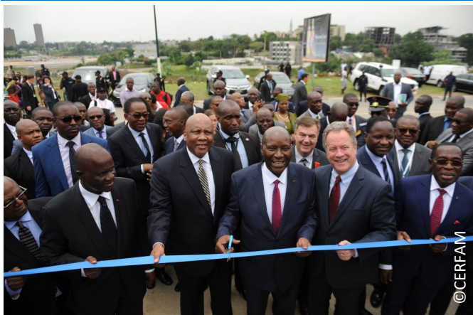
The Regional Center of Excellence against Hunger and Malnutrition (CERFAM) was inaugurated in Abidjan on March 25, 2019 . It is the third center after those in China and Brazil. In the photo: the Vice President of Cote d'Ivoire, the King of Lesotho, the Executive Director of WFP, as well as many political and administrative figures.