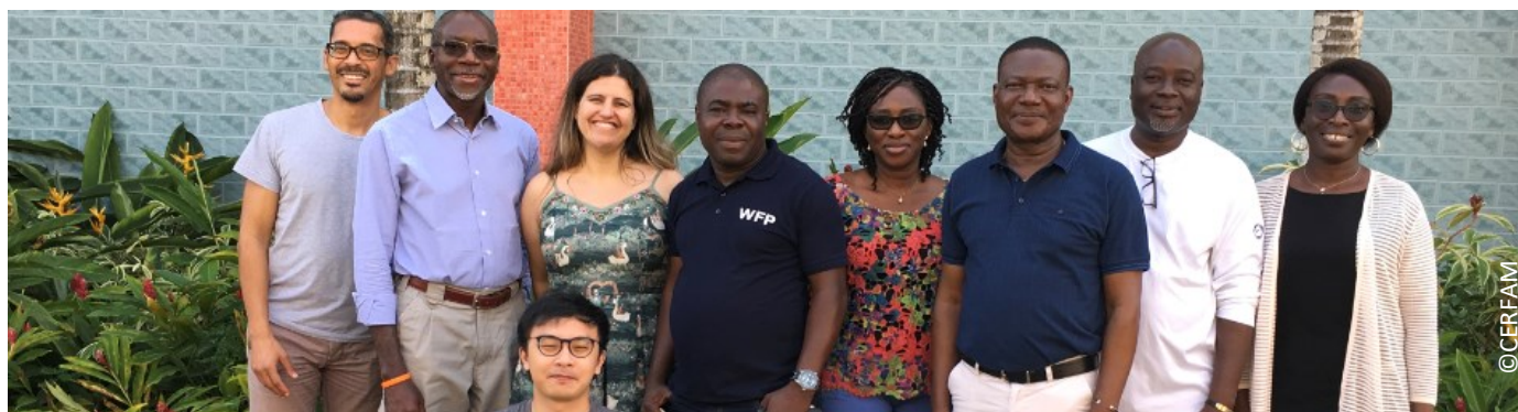
The staff took advantage of the retreat to discuss the achievements obtained in 2019 and identified the opportunities and priorities to come for 2020

Review of activities, prospects for 2020 and team building were part of the Agenda of the CERFAM's first Retreat