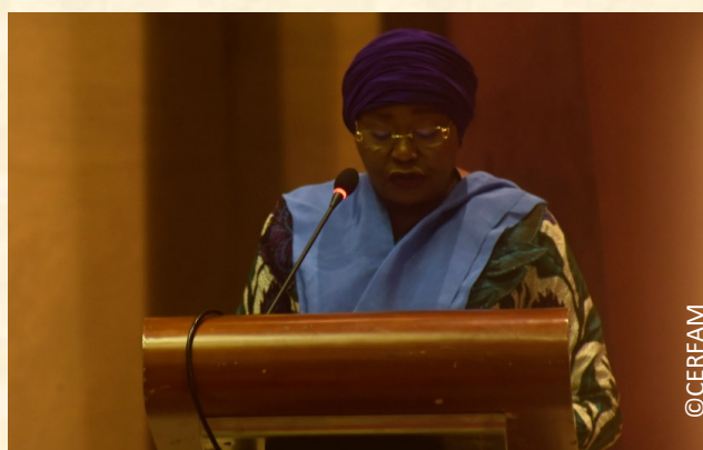
S.E.M. Josephine Kala, African Union representative in Côte d'Ivoire:

"... In Côte d'Ivoire, data indicate a reduction in the prevalence of moderate food insecurity to 10.8% in 2018 and the elimination of the severe form of food insecurity, the reduction in the prevalence of stunting in children under 5 from 29.8% in 2012 to 21.6% in 2016. I reiterate Côte d'Ivoire's commitment to fight hunger and malnutrition in collaboration with the countries of the region, in order to make progress towards the implementation of the Malabo Declaration of the African Union by 2025 and the 2030 Agenda of the United Nations related to the Sustainable Development Goals (SDGs)".