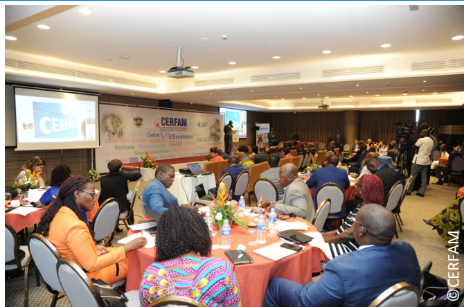
First CERFAM Regional Concertation on the state of progress of the Roadmaps for the elimination of hunger and malnutrition in Africa organized by CERFAM on June 25, 2019 . For the participants in this concertation, union and coordination efforts will make it possible to achieve the nutritional and food security objectives for the populations.