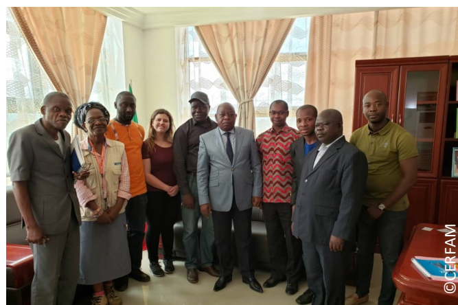
As a prelude to a capacity building mission for Congolese producers in cassava processing ( 11 Nov to 16 Dec ), a delegation of experts from the Ministry of Agriculture of Cote d'Ivoire, led by CERFAM, carried out a preparatory mission to identify needs and logistics. In the picture, the family photo of the Ivorian delegation and CERFAM with the Congolese Minister of Agriculture.