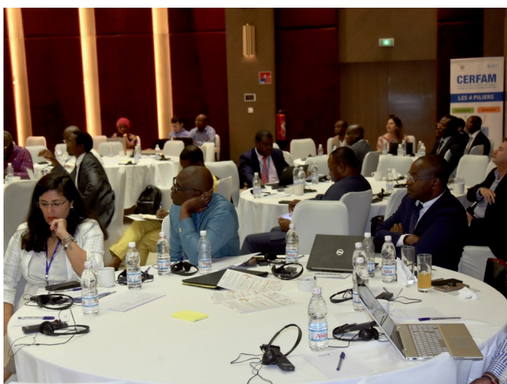
For experts presents at the workshop, Africa is full of endogenous good practices and expertise related to post-harvest losses management and agriculture which should be better recognized, scaled up and shared.

8. There is an urgent need to invest in education and increase public awareness, including our future generations, on post-harvest losses, food waste and waste management in order to raise awareness of their harmful impacts on income, nutritional status and well-being and promote the adoption of behaviors that do not jeopardize ecosystems.