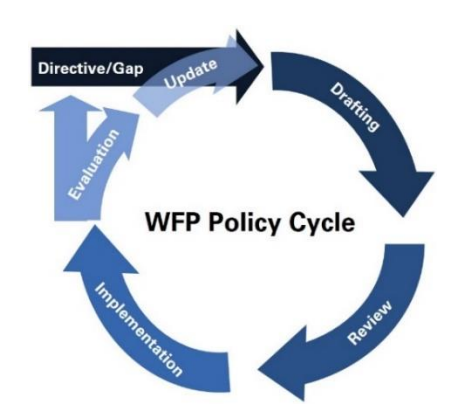
Figure 1: WFP policy cycle

<sup>3</sup> "WFP Policy Formulation" (WFP/EB.A/2011/5-B).