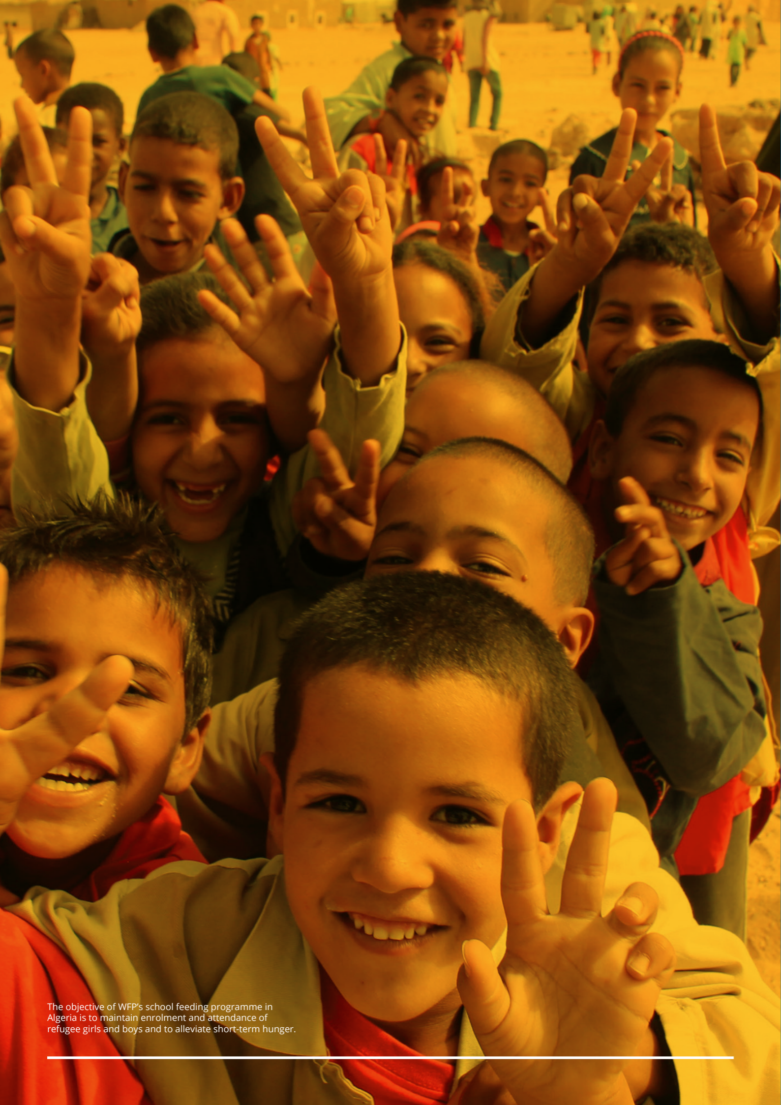
The objective of WFP's school feeding programme in Algeria is to maintain enrolment and attendance of refugee girls and boys and to alleviate short-term hunger.