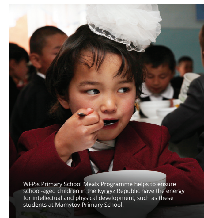
WFP's Primary School Meals Programme helps to ensure school-aged children in the Kyrgyz Republic have the energy for intellectual and physical development, such as these students at Mamytov Primary School.