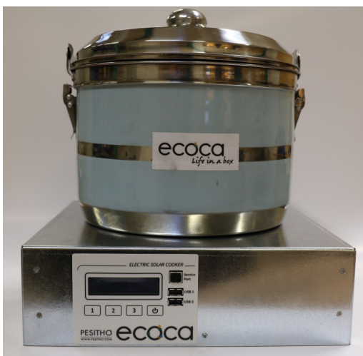
Picture of the ECOCA e-cooker, showing the base and the 5 litre pot which has a 400W heating element inside it.

Following this phase, WFP employees have been asked to confirm their interest to buy the appliance through either paying upfront or instalments deducted from their salary by WFP. The upfront capital investment to obtain the ECOCA might be much higher than the cost of buying a traditional stove, however, when analysing cooking expenditure over a number of years and factoring in the monthly amount spent on charcoal for cooking, the ECOCA actually becomes more