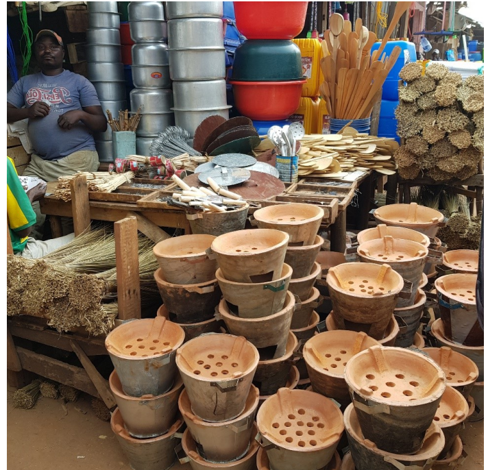
Charcoal cookstoves sold among household items in a market in Burundi.

This situation is affecting nutrition and food security as well. When fuel is expensive or hard to acquire people are forced to adopt negative coping mechanisms such as under-cooking, which decreases the food's nutritional value, bartering food for fuel, purchasing less food or less nutritious food to afford the fuel necessary to cook it or skipping meals. All of these coping strategies have a strong impact on hunger. Lack of fuel also limits the ability to boil water for drinking which exposes people, particularly children, to waterborne diseases that further limit the absorption of nutrients. Therefore, WFP's mandate on food security cannot be met without addressing cooking issues.