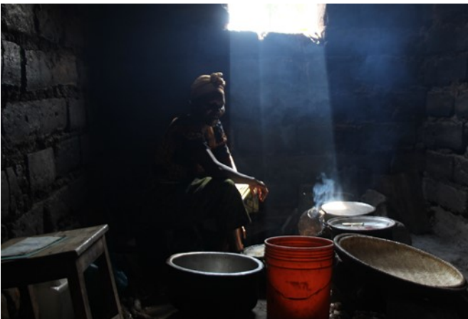
Women exposed to unhealthy smoke in Ruyigi camp, Burundi. Lack of access to modern energy solutions has health implications as well.

Bioenergy scarcity is increasingly becoming a challenge, particularly in areas surrounding refugee settlements due to the added pressure on shared natural resources. In many places this tends to contribute to tensions between refugees and the host populations, exposing the people that collect fuel, mostly women and children, to threats and harassment.