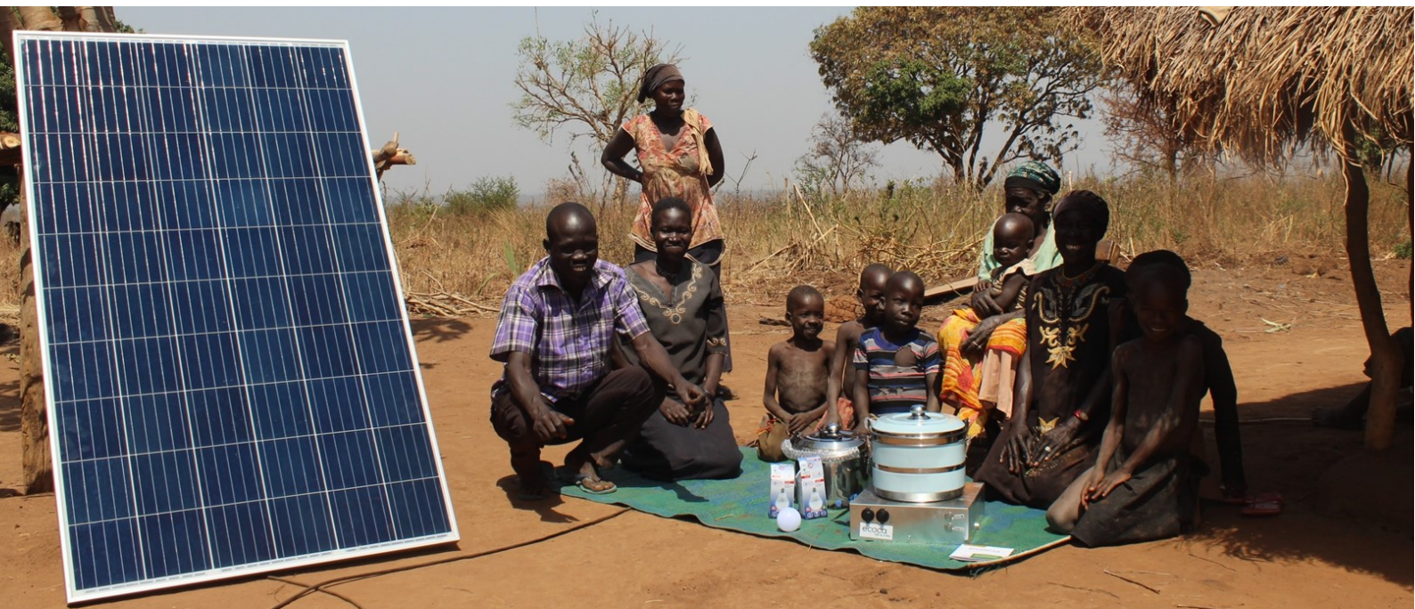
A household using the ECOCA for cooking.

affordable. To make the ECOCA affordable for households with low monthly spending capacity, a pay-as-you-go model will be developed, which will allow end-users to pay for the unit in instalments.