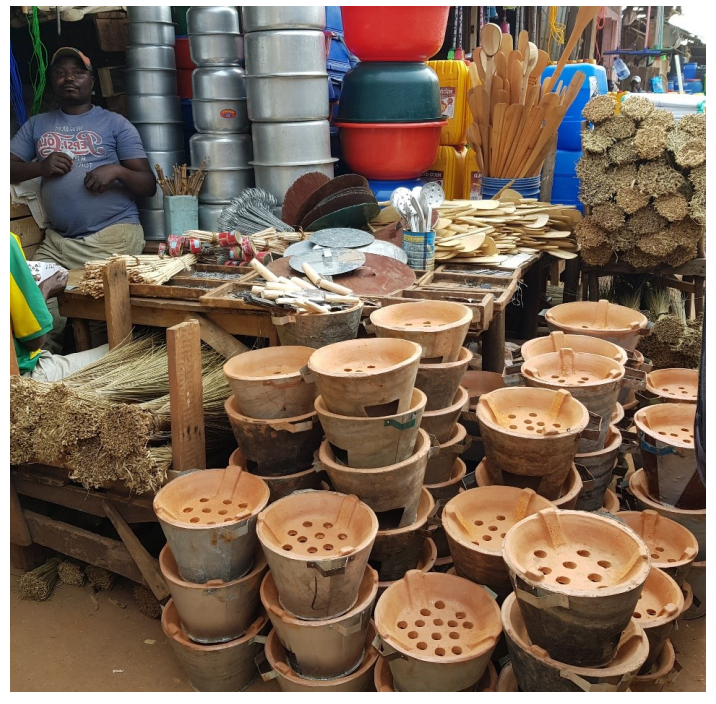
Charcoal cookstoves sold among household items in a market in Burundi.

This situation is affecting nutrition and food security as well. When fuel is expensive or hard to acquire people are forced to adopt negative coping mechanisms such as under-cooking, which decreases the food's nutritional value, bartering food for fuel, purchasing less food or less nutritious food to afford the fuel necessary to cook it or skipping meals. All of these coping strategies have a strong impact on hunger. Lack of fuel also limits the ability to boil water for drinking which exposes people, particularly children, to waterborne diseases that further limit the absorption of nutrients. Therefore, WFP's mandate on food security cannot be met without addressing cooking issues.