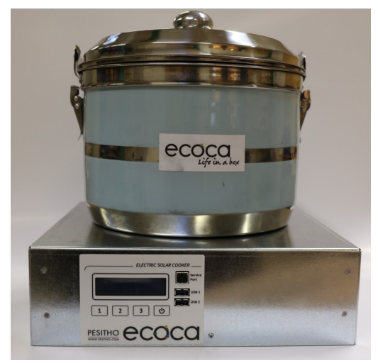
Picture of the ECOCA e-cooker, showing the base and the 5 litre pot which has a 400W heating element inside it.

Aside from cooking, the ECOCA can be used to charge light bulbs, phones and small appliances, a feature appreciated in Bujumbura which is affected by frequent black outs.