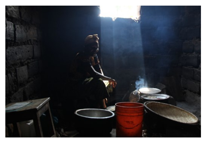
Women exposed to unhealthy smoke in Ruyigi camp, Burundi. Lack of access to modern energy solutions has health implications as well.

Bioenergy scarcity is increasingly becoming a challenge, particularly in areas surrounding refugee settlements due to the added pressure on shared natural resources. In many places this tends to contribute to tensions between refugees and the host populations, exposing the people that collect fuel, mostly women and children, to threats and harassment.