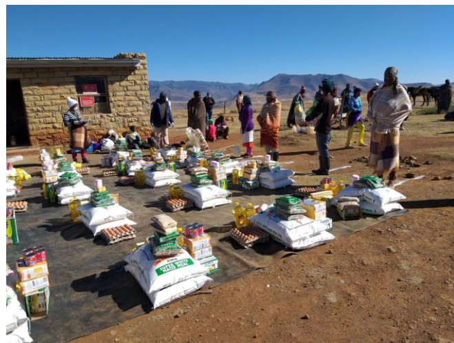
Beneficiaries observe social distancing at emergency distribution site.