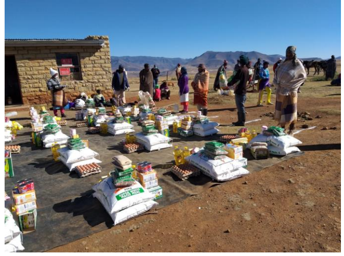
Beneficiaries observe social distancing at emergency distribution site.