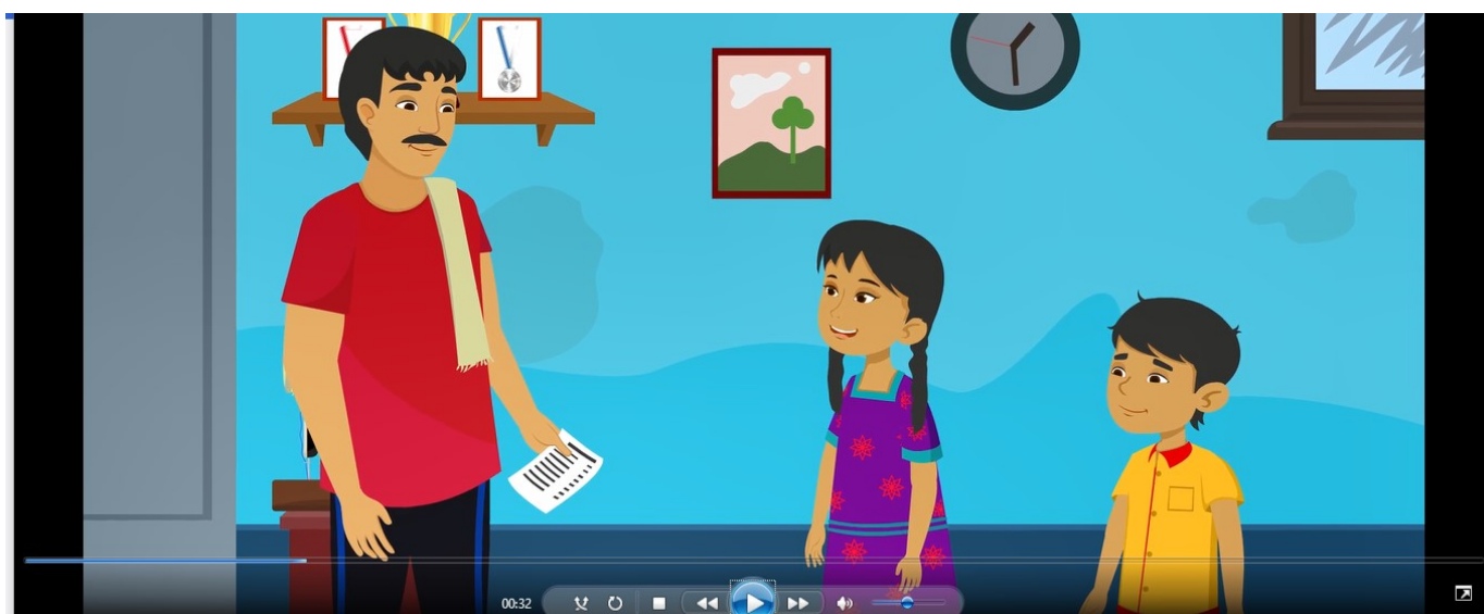
Snapshot of one of the 4 animated videos being created as SBCC material in context of COVID19

WFP is developing 4 short animated videos in local languages (Hindi, Oriya and Malayalam) to raise awareness on: COVID-19 prevention; Maintaining health and nutrition during the pandemic and Community harmony and positive reinforcement of good practices (incorporating Gender and inclusion).