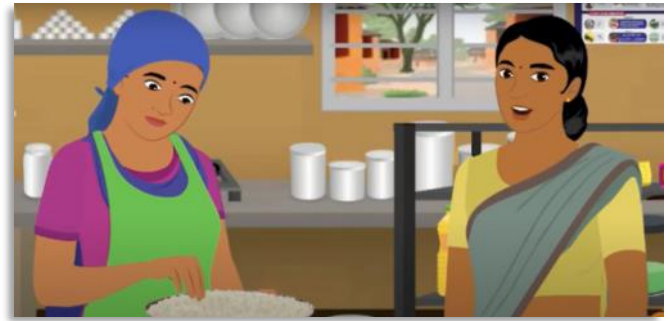
Snapshot of video on methods of cooking for retaining nutrients

The Odia version of this playlist can be found here: https://bit.ly/2Ab6esF