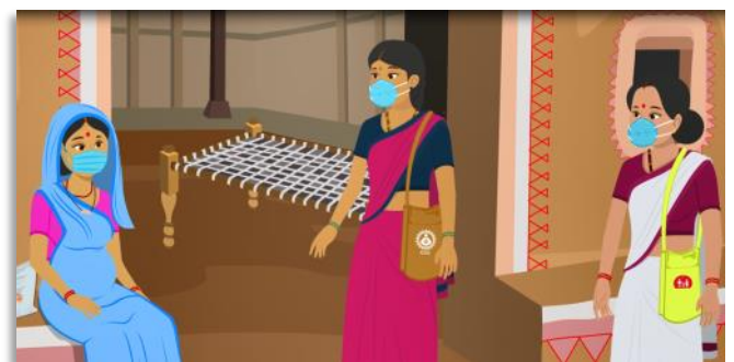
Snapshot of video on 'maintaining good health and nutrition for pregnant women during the COVID crisis'