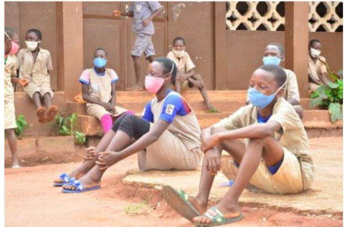
Pupils respecting COVID-19 protection and distancing measures at the primary school of Djègoun Nagot, in the commune of Ifangni, Department of Plateau, Benin.