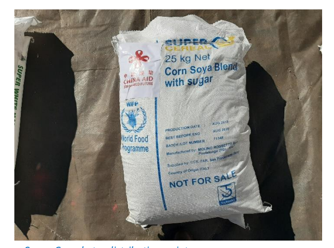
Super Cereal at a distribution point.