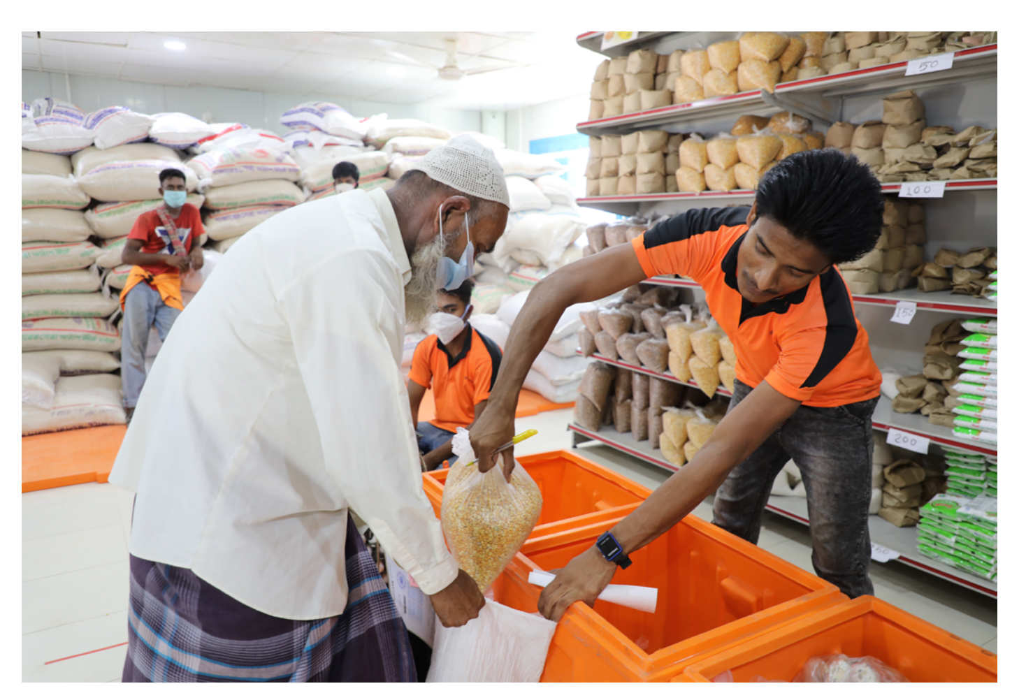
WFP food assistance continues in the camps for the Rohingya refugees living in Cox's Bazar, Bangladesh.

In the Pacific, Fiji recorded the last case on 21 April and no new cases since then. No COVID-19 related deaths have been recorded, and around a dozen countries remain virus-free.