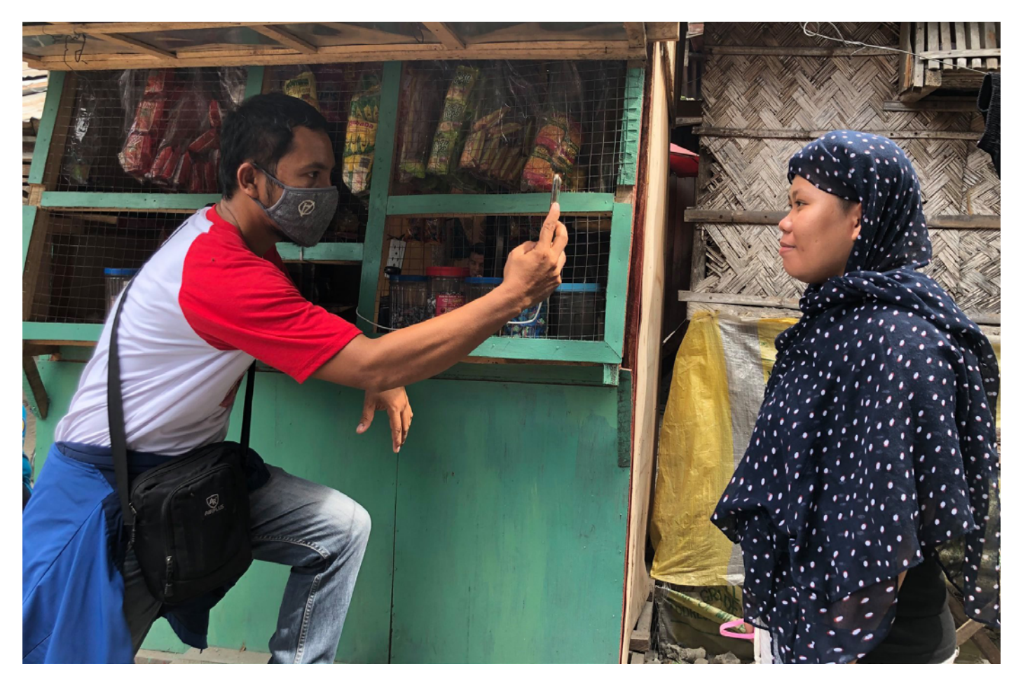
In the Bangsamoro region, the Philippines, WFP helped register more than 350,000 vulnerable families to enable them receive a government cash subsidy in support of population affected by COVID-19.