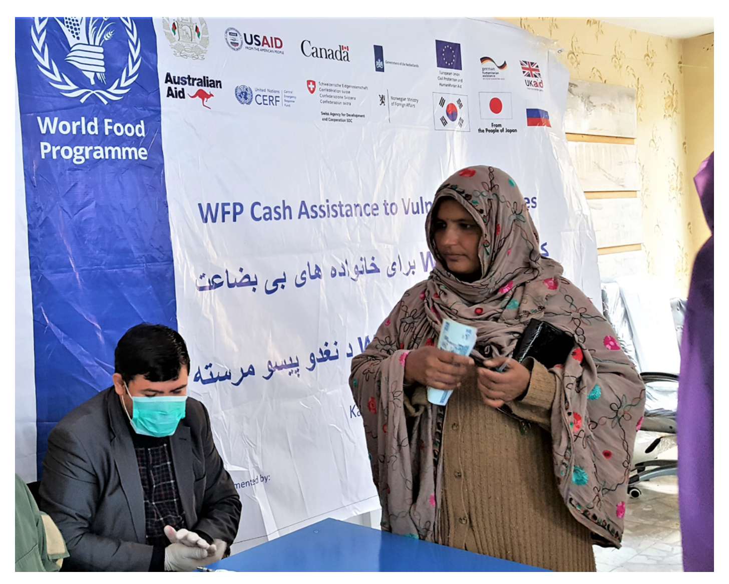
A WFP cash distribution site in Afghanistan. Staff now wear protective masks as part of the COVID-19 prevention measures.

The report may refer to all countries in Asia and the Pacific region, but focus will be on countries where WFP is operational: South Asia - Afghanistan, Bangladesh, Bhutan, India, Nepal, Pakistan and Sri Lanka; Southeast Asia - Cambodia, Democratic People's Republic of Korea, Indonesia, Lao PDR, Myanmar, the Philippines, Timor-Leste; the Pacific: Federated States of Micronesia, Fiji, Kiribati, Marshall Islands, Nauru, Palau, Samoa, Solomon Islands, Tonga, Tuvalu, and Vanuatu