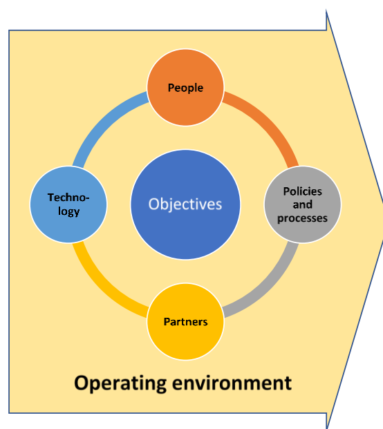
Figure 1. Technology as part of a broader dynamic “technology use system”