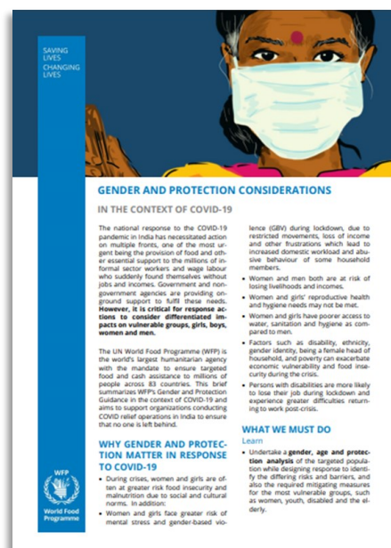
Snapshot of guidelines on Gender & Protection Considerations in the context of COVID-19

The note was shared with more than 150 NGOs in Uttar Pradesh, Odisha and other states who were implementing various front-line COVID responses. The note can be accessed at: bit.ly/2MvLOxt