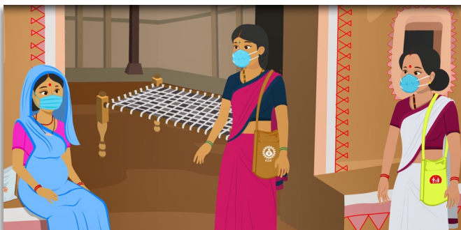
Snapshot of one of the Hindi-videos on COVID19 Prevention