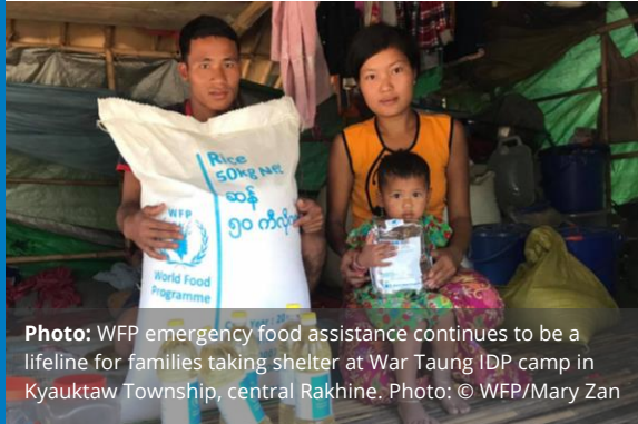
Photo: WFP emergency food assistance continues to be a lifeline for families taking shelter at War Taung IDP camp in Kyauktaw Township, central Rakhine.