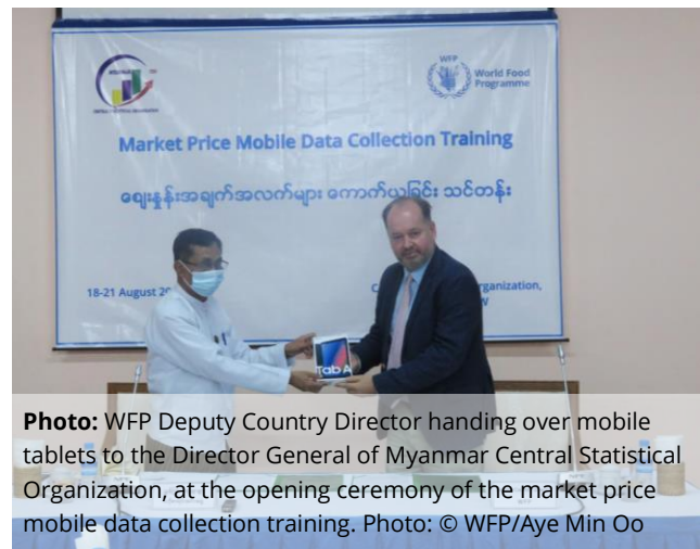
Photo: WFP Deputy Country Director handing over mobile tablets to the Director General of Myanmar Central Statistical Organization, at the opening ceremony of the market price mobile data collection training.

This support will also enhance the Government’s capacity to assess wider socio-economic impact of the COVID-19 pandemic across the country.