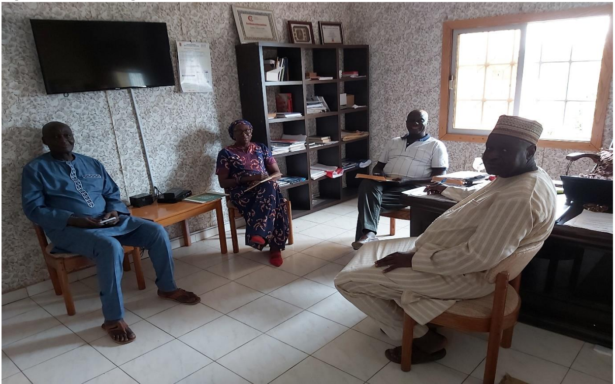
Figure 5.1: Consulting with members of CFAN

Thus, in the start-up meetings during the inception period of this contract, it was agreed that visits to potential Project sites should be postponed for the time being, given the current COVID -19 pandemic. Nonetheless, taking into account the need for compliance with national laws, as well as WHO advise, measures were taken to identify project activities for which engagement is critical and cannot be postponed without having significant impact on Project timelines. Large public meetings were avoided, and instead consultations with local and national government agencies, on one on-one consultations, or in small-group sessions were conducted, including telephone conversations, where possible. The summary of the consultations is attached as Appendix 5.2, and the list of persons/institutions met is in Appendix 5.3. Figure 5.2 shows the meeting with the Executive Director of NEA