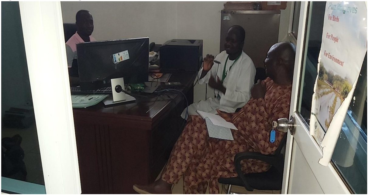
Figure 5.2: Consulting with the Executive Director of NEA