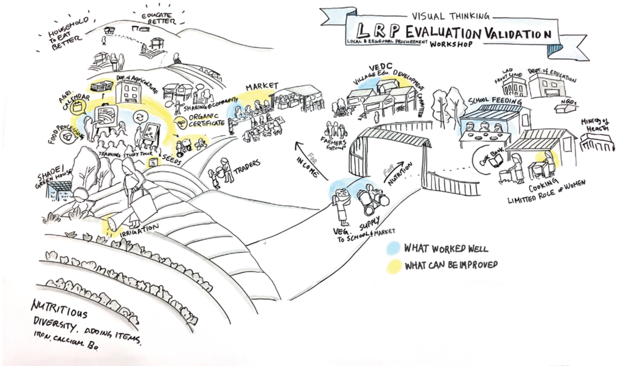
Summary of Validation workshop of USDA Local and Regional Procurement project in Nalae District, Luang Namtha Province in Lao PDR 18-20 December, 2019