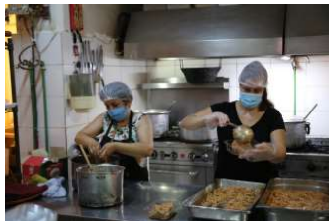
A community kitchen in Beirut.

In the heart of old Beirut, A+ Initiatives is one of many organizations who received food parcels from WFP over the past two months following the blast at Beirut port. Cyril, the founder, says WFP's donation of food items are welcome.