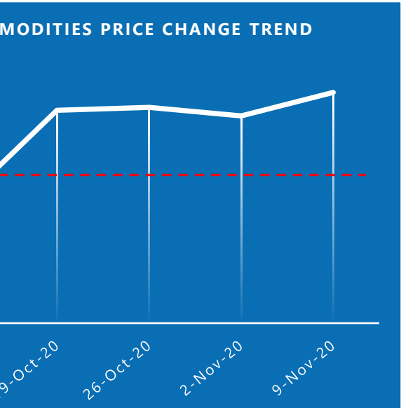
change of prices for ten commodities in the nine monitored ainst the previous weeks and monthly average prices of October re are wheat flour (first grade), potatoes, onion, milk, eggs,

pared with the monthly average of October 2020, s for both commodities increased in all monitored ket in the range of 4-27 percent .