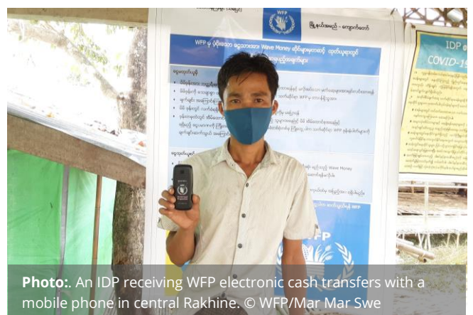
An IDP receiving WFP electronic cash transfers with a mobile phone in central Rakhine.

This approach minimises the risk of COVID-19 transmissions where beneficiaries receive their rations in a safe and efficient manner. Moreover, WFP cash assistance empowers the beneficiaries with the agency to make their own spending choices to buy essential goods and services, which helps boost local markets and cushions the financial burden on small retailers.