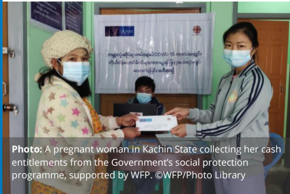
Photo: A pregnant woman in Kachin State collecting her cash entitlements from the Government's social protection programme, supported by WFP. ©WFP/Photo Library