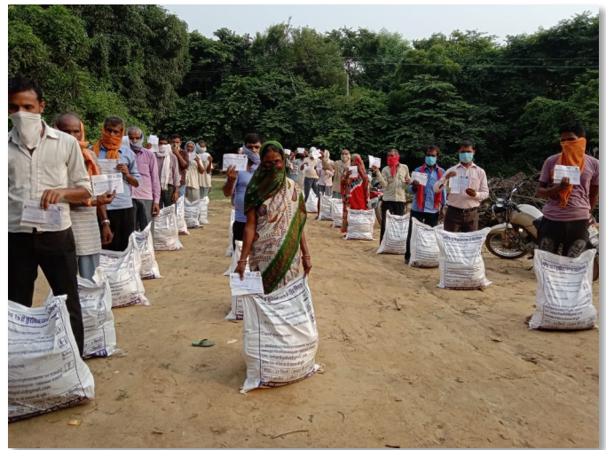
Snapshot of Lucknow’s food distribution by SAMARTH

holds of transgender, female and male sex workers, migrants, disabled and chronically ill, comprising about a fourth of the total 4011 households, were covered in the