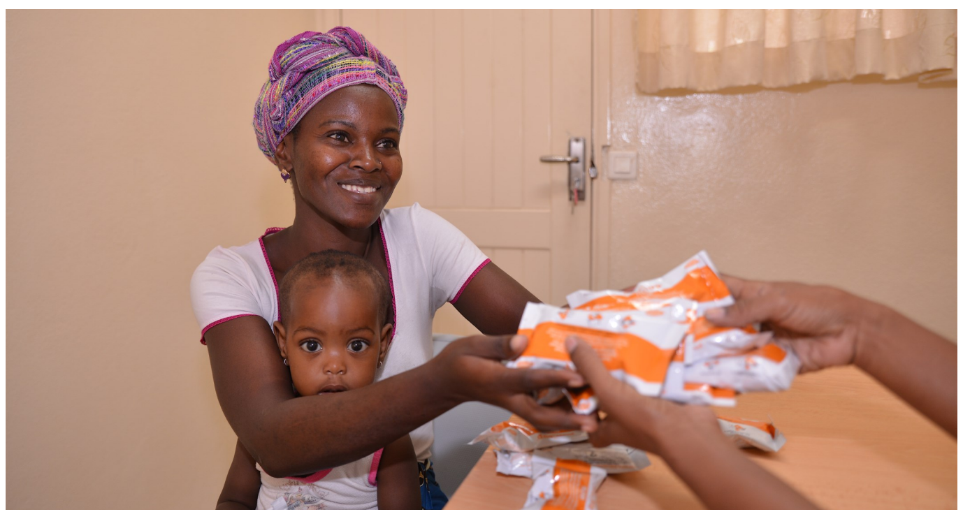
Mother and child enrolled in the Programme for Nutrition Rehabilitation receiving RUSF

facilities, as well as at camps for internally displaced people who have fled the insurgency in Cabo Delgado. WFP is also supporting the vulnerable population in Marratane refugee camp with MAM treatment, through the camp's health facility. This health facility covers the camp's population, as well as several neighbouring communities.