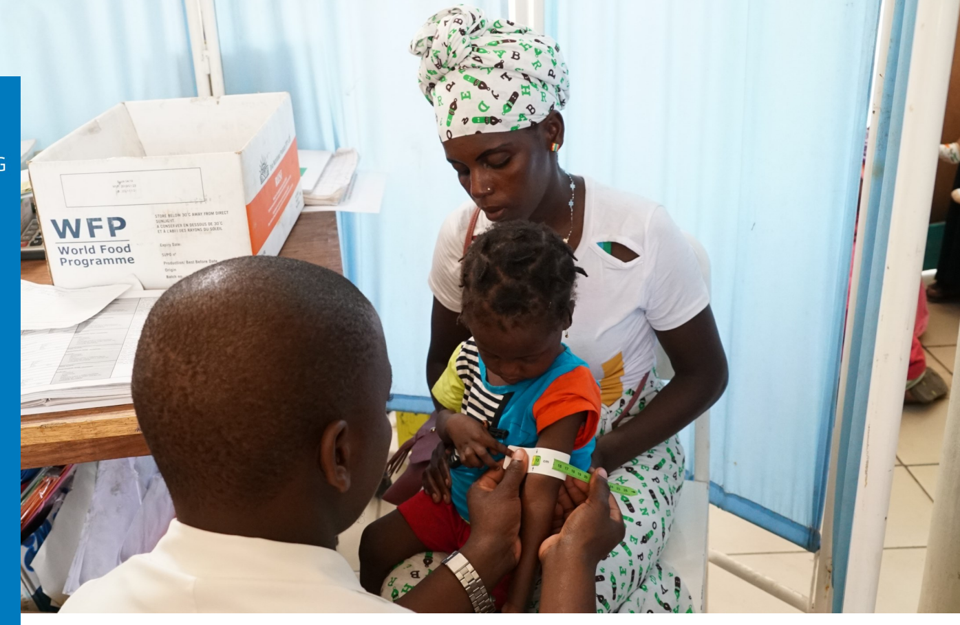
Nutritionist at health center assessing a child's mid-upper arm circumference (MUAC) to understand the level of malnutrition