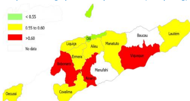
Map. 1. Average price of Imported rice (US$ per kg)

On the global front, the FAO Rice Price Index extended the upward trend into a third straight month in February 2021, reaching 116.0 points, up 1.5 percent from January and a further 11.4 percent from a year earlier. Thai and Vietnamese rice, key imported commodity, remained on an upward curve due to limited supplies.