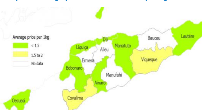
Map. 2: Average price of local rice US$ per kg

Maize grain price continues to remain relatively low and stable, likely due to ongoing harvests. While wheat flour prices remain subdued (Fig 2).