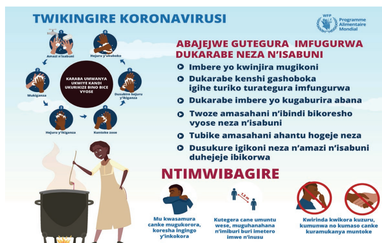
Figure 4: Guidance for safe school meal production during COVID-19 in Burundi