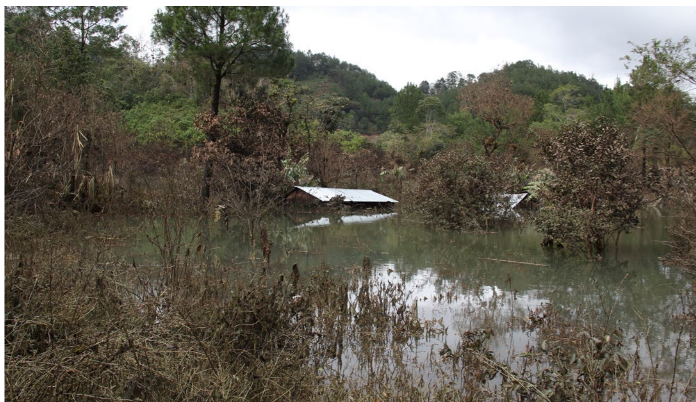
WFP - Guatemala