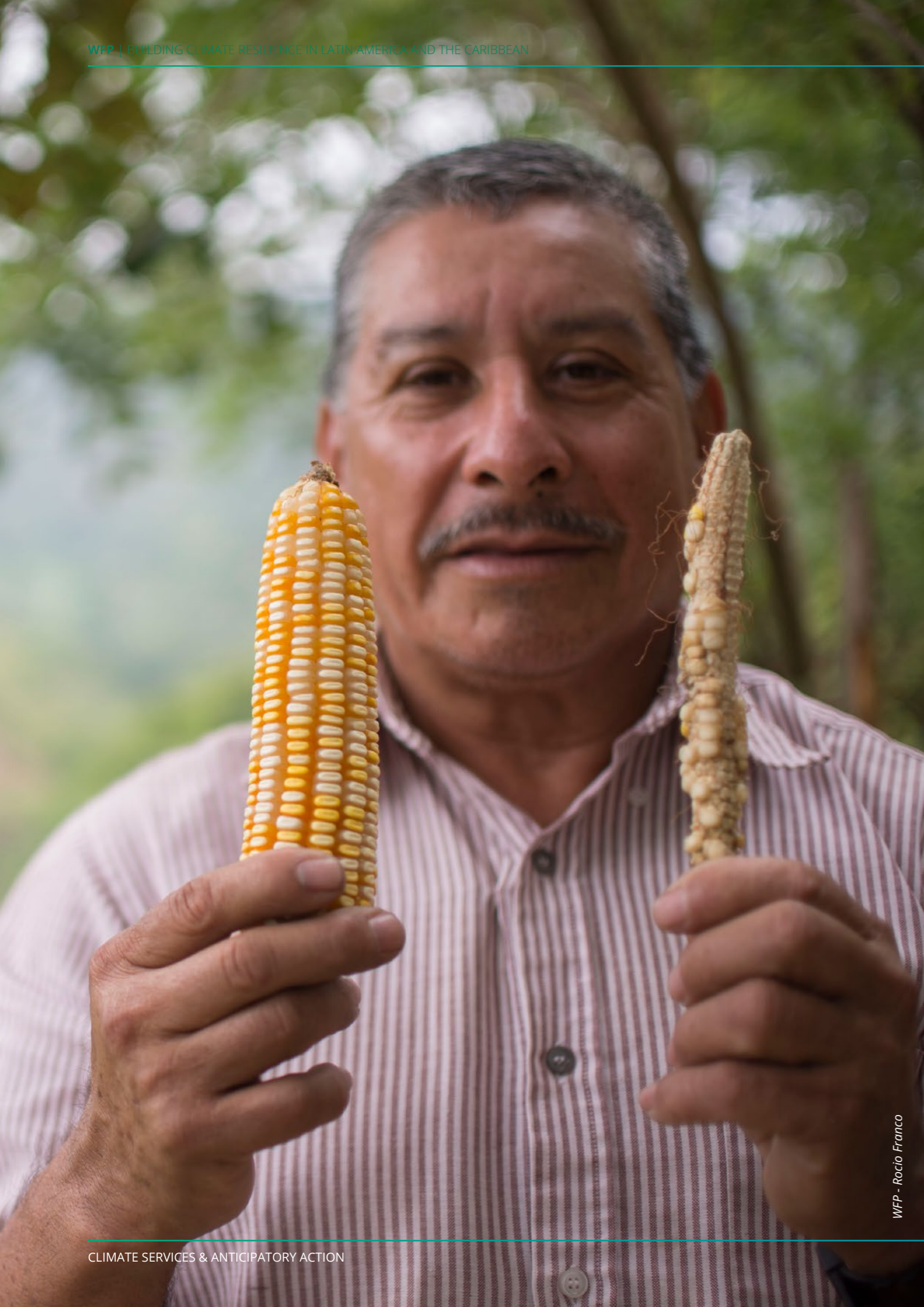
WFP - Rocío Franco