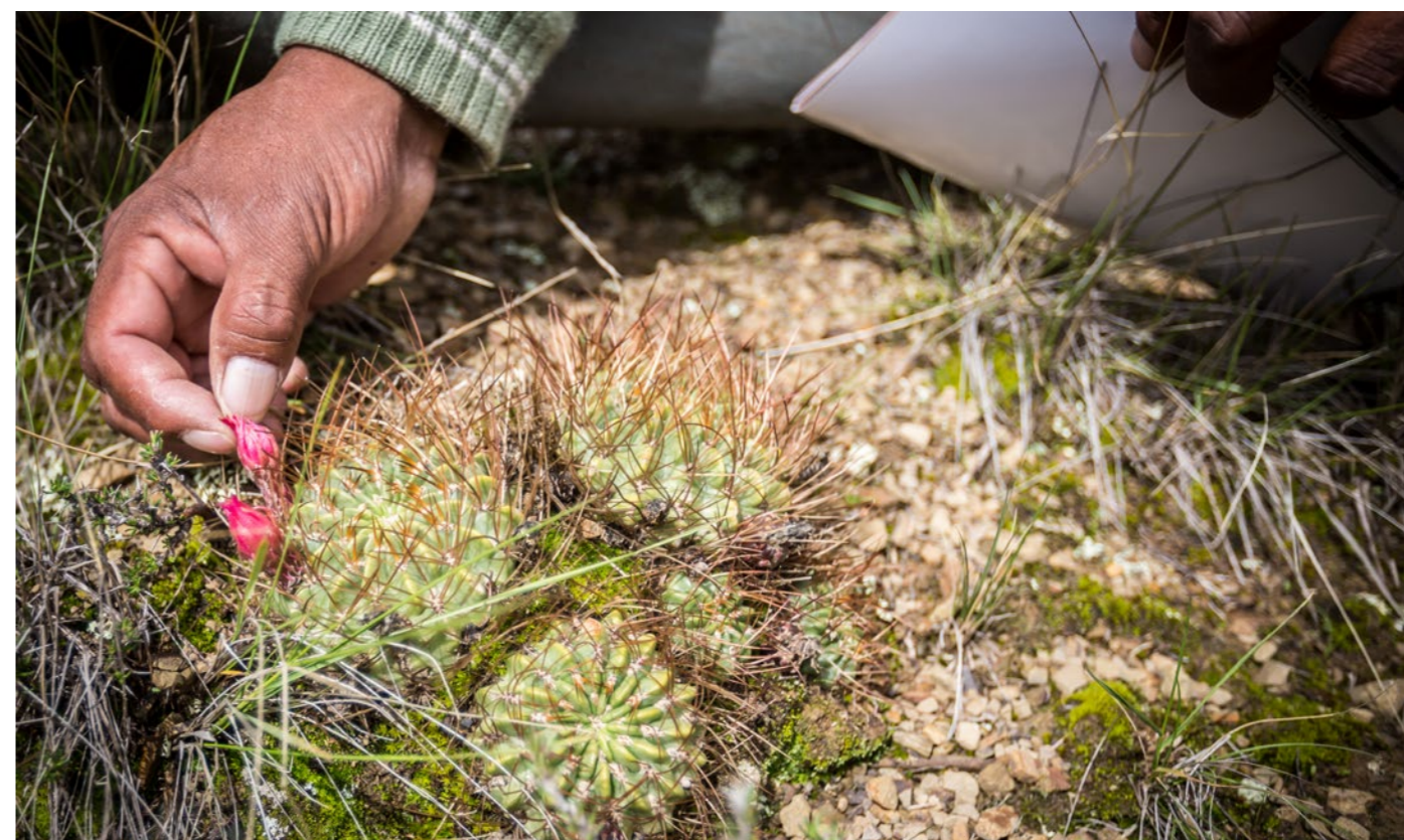
Prosuco - Bolivia