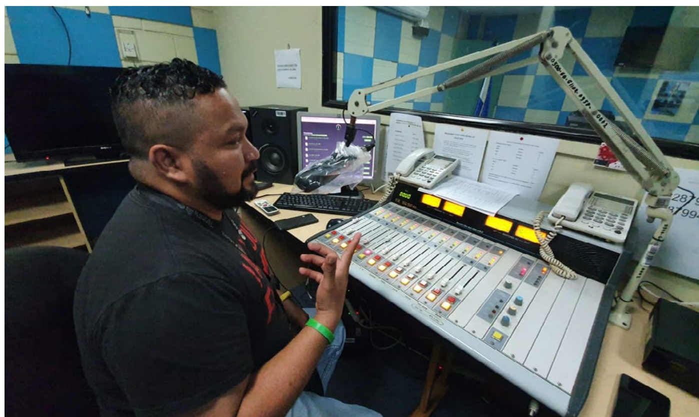
WFP - El Salvador