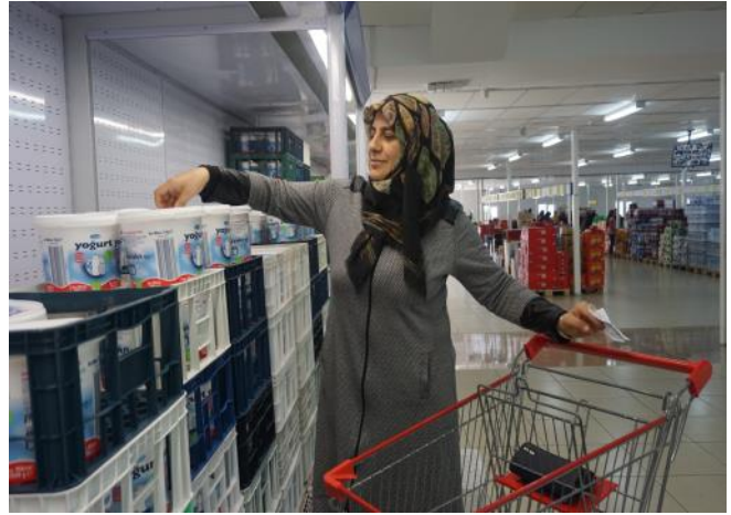
WFP's e-food card programme is implemented in partnership with the Government of Turkey and TRC.

More than 99 percent of refugees in Turkey live outside of camps in towns and villages. Many live in poverty. The most vulnerable of them are assisted by the Emergency Social Safety Net (ESSN) programme, which provides monthly cash assistance to more than one and a half million refugees (42.5 per cent of the total number of refugees living in Turkey) to help them cover their basic needs.