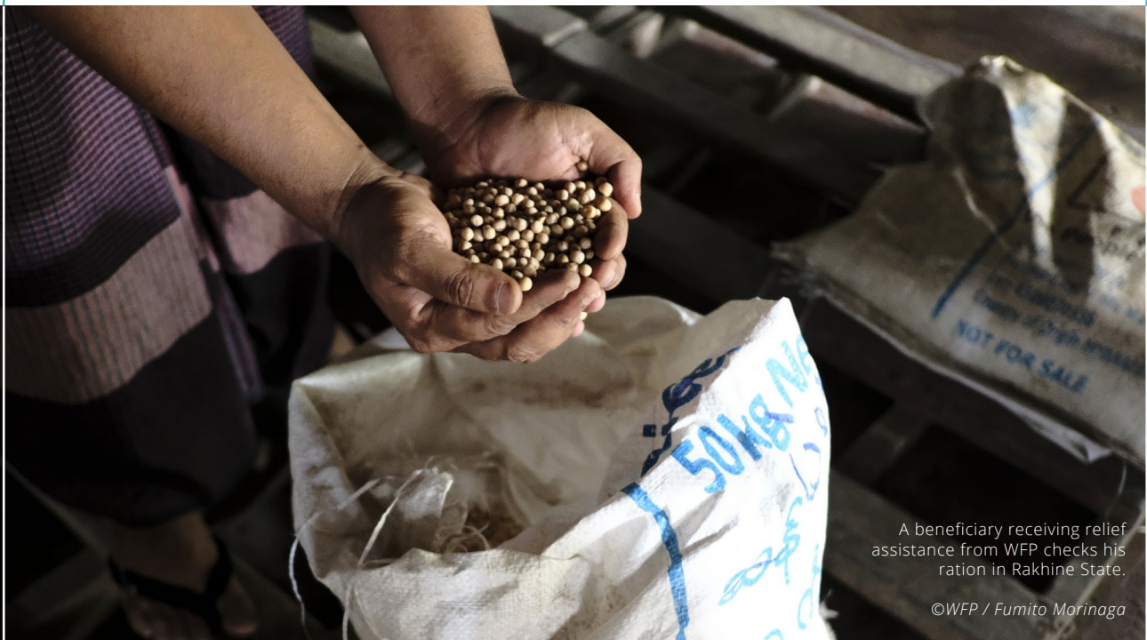
A beneficiary receiving relief assistance from WFP checks his ration in Rakhine State.

Conduct a specific study to further understand the levels of household debt.