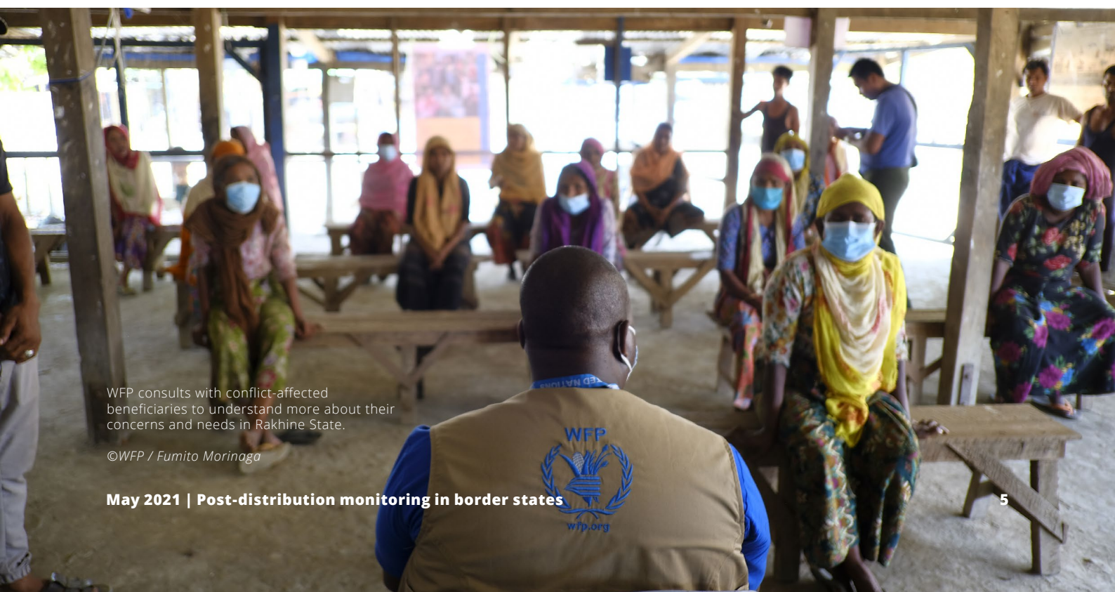
WFP consults with conflict-affected beneficiaries to understand more about their concerns and needs in Rakhine State.