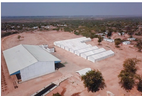
From the sky: the Humanitarian Staging Area in Bangula, Nsanje district

Pillar 1 - Humanitarian Staging Area (HSA) and Mobile Logistics Bases (MLB). This pillar focuses on the establishment of an HSA in Bangula, Nsanje district and the repositioning of MLBs in Blantyre to cover districts in the south, and in Lilongwe to cover the central districts. The HSA and MLB will save valuable time and resources in deploying emergency assistance at the onset of disasters. Budget for pillar 1 is USD 450,000.