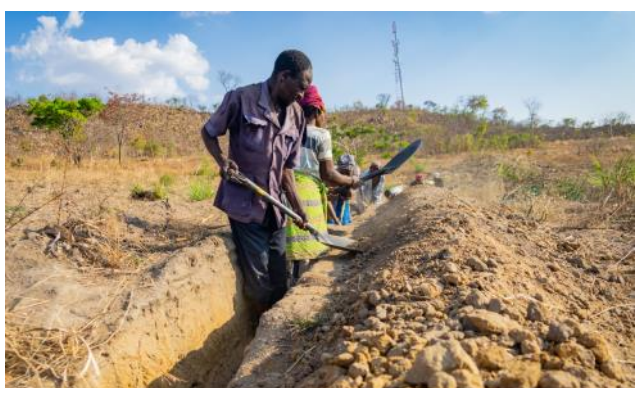
Farmers digging individual trenches to retain moisture in the fields before the planting season.

To have a significant impact, watershed management needs to be conducted at a larger more community or inter-community scale and not just in individual farming plots. This collective approach is critical in order to build, rehabilitate and maintain the necessary water and soil conservation structures.