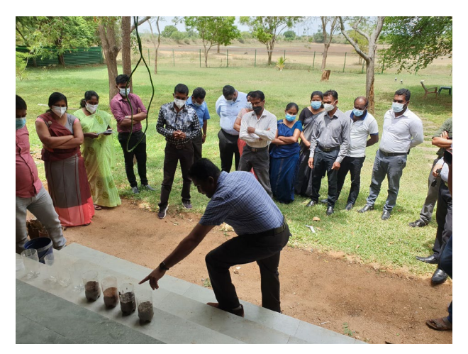
Soil saturation conditions being explained during WFP's Training of Trainers (TOT) programme for field- based agriculture officials of Monaragala district, / LMCS project.

Top donors to WFP Sri Lanka CSP 2018-2022 include: Government of Republic of Korea, Regional Trust Fund allocations, Government of Japan, Private donors, flexible funds.