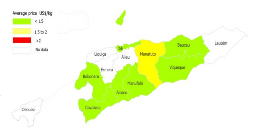
Map. 2: Average price of imported rice (US$/kg)