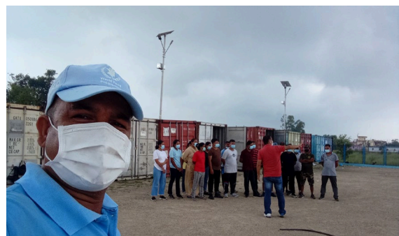
Above: Photo from the Practical Emergency Logistics Training (9-12Aug2021) at PHSA Birgunj.