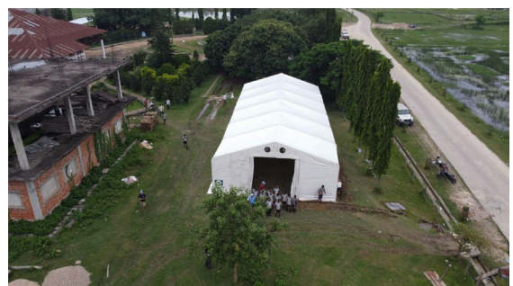
Below: A Mobile Storage Unit erected by WFP in Province 2.