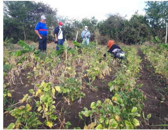
Figure 2: Placement of boxes for the crop cut in Manatí

In 2021 efforts are underway with a crop cut exercise in selected farms for maize, beans and coffee producers, and which will guide the insurance product design. Due to movements restrictions associated with the COVID-19 pandemic, staff members from agricultural centres were trained remotely to support Pula Advisors and ESEN in placing the boxes and conducting the crop cut exercises. Considering also the distinctive context of Cuba, innovative design elements for the insurance product are being explored among the partners.