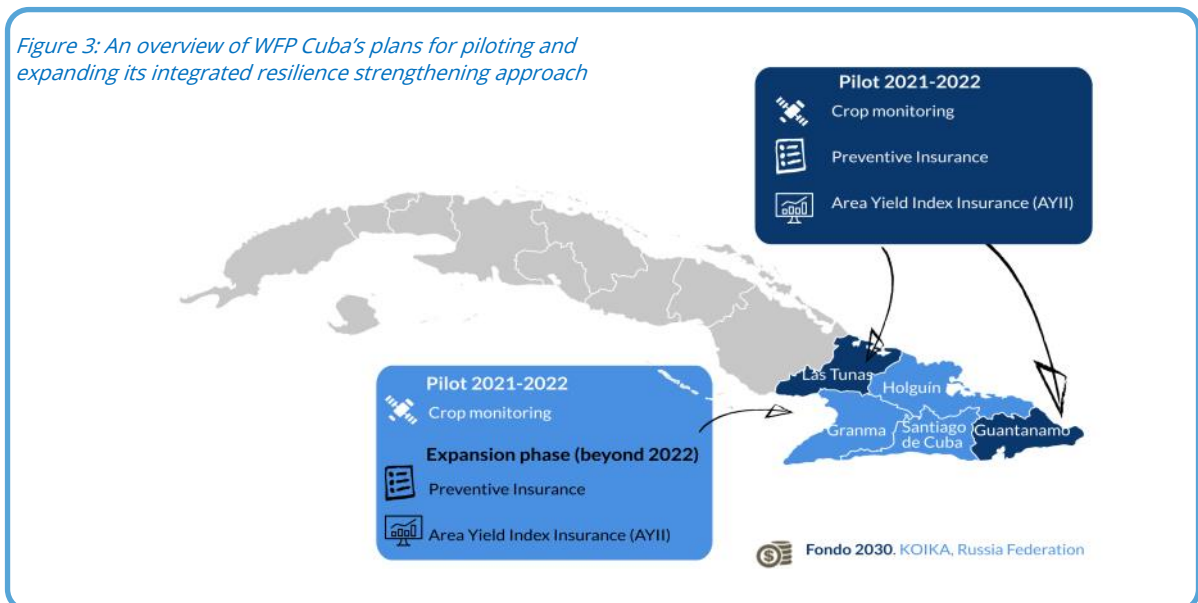
Figure 3: An overview of WFP Cuba's plans for piloting and expanding its integrated resilience strengthening approach

Building on these activities and realising the opportunities offered in validating data generated during the insurance pilot to strengthen EWS for the agricultural sector, WFP and the Agricultural Meteorology Centre of the Cuban Institute