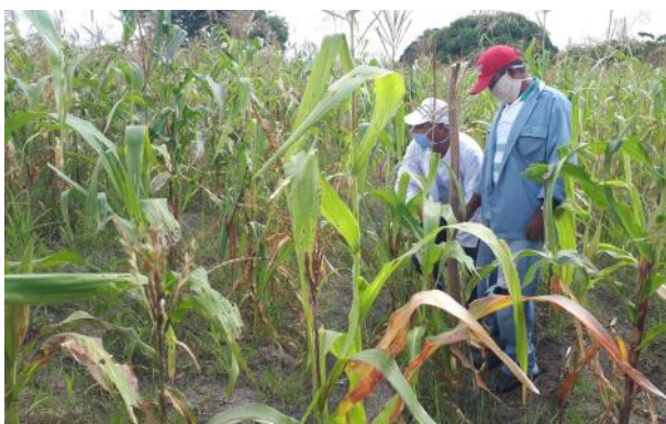
Figure 4: Placement of boxes for the crop cut in Manatí

WFP has set up satellite data streams and implementation of the integration with station data is advancing. The portfolio of agro-meteorological products will be directly accessible both by the Agricultural Meteorology Centre of the Cuban Institute of Meteorology (Havana) and the Meteorology Centres of the selected provinces. Once usage is mainstreamed, products and applications will be tailored to local requirements with a view to maximise usability and usefulness. This will support farmers and cooperatives with decision making on the when and what to plant, but also early warning and risk management, while the government will be able to better predict when food shortages occur for food allocations. Once the AYII product is designed through the data validation under this crop monitoring work, ESEN will also benefit from the data for potential claims for the “preventive insurance” product, as well as in monitoring the index reliability and any mismatches with payouts that