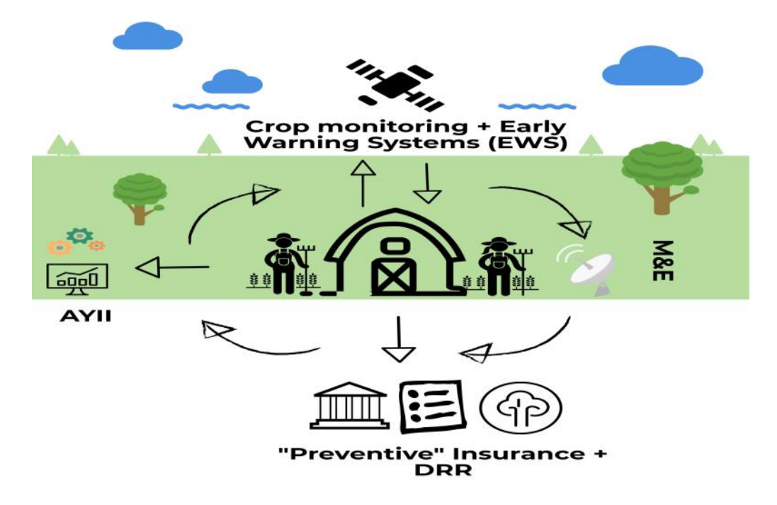
Figure 1. WFP Cuba's integrated approach to reduce the vulnerability of farmers to drought and climate change

WFP Cuba's efforts align with WFP's <u>Regional Risk Financing</u> <u>Strategy</u> that promotes inclusive risk finance policies, programmes and partnerships that are sustainable and scalable. The Strategy emerged out of a need to address different economic and weather-related shocks that Latin America and the Caribbean are exposed to, with risk finance instruments being an important tool that can contribute to strengthening resilience in the region.