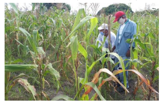
Figure 4: Placement of boxes for the crop cut in Manatí

WFP has set up satellite data streams and implementation of the integration with station data is advancing. The portfolio of agro-meteorological products will be directly accessible both by the Agricultural Meteorology Centre of the Cuban Institute of Meteorology (Havana) and the Meteorology Centres of the selected provinces. Once usage is mainstreamed, products and applications will be tailored to local requirements with a view to maximise usability and usefulness. This will support farmers and cooperatives with decision making on the when and what to plant, but also early warning and risk management, while the government will be able to better predict when food shortages occur for food allocations. Once the AYII product is designed through the data validation under this crop monitoring work, ESEN will also benefit from the data for potential claims for the "preventive insurance" product, as well as in monitoring the index reliability and any mismatches with payouts that