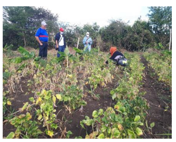
Figure 2: Placement of boxes for the crop cut in Manatí

In 2021 efforts are underway with a crop cut exercise in selected farms for maize, beans and coffee producers, and which will guide the insurance product design. Due to movements restrictions associated with the COVID-19 pandemic, staff members from agricultural centres were trained remotely to support Pula Advisors and ESEN in placing the boxes and conducting the crop cut exercises. Considering also the distinctive context of Cuba, innovative design elements for the insurance product are being explored among the partners.