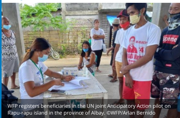
WFP registers beneficiaries in the UN joint Anticipatory Action pilot on Rapu-rapu island in the province of Albay.