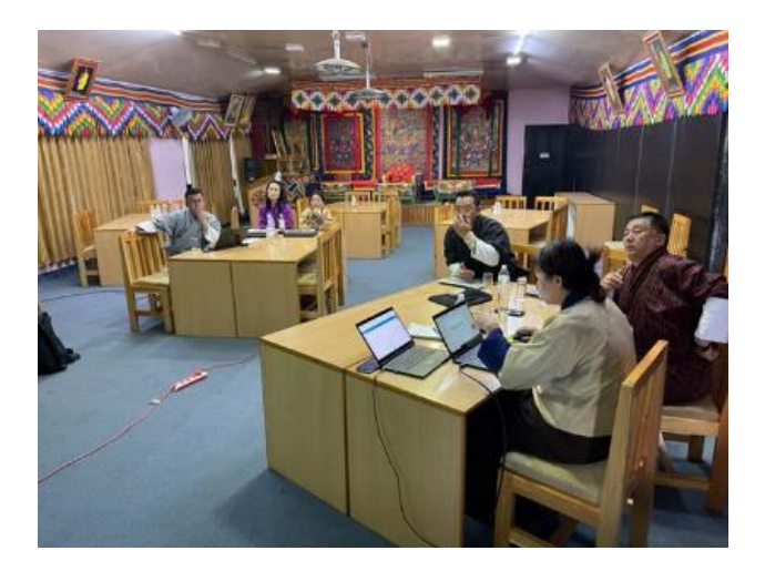
Photo Page 1: Participants at the Codex Advocacy Workshop, Punakha.

Photo Page 2: Participants of agriculture monitoring & reporting training, Paro.