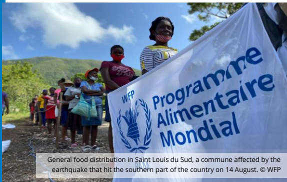
General food distribution in Saint Louis du Sud, a commune affected by the earthquake that hit the southern part of the country on 14 August.