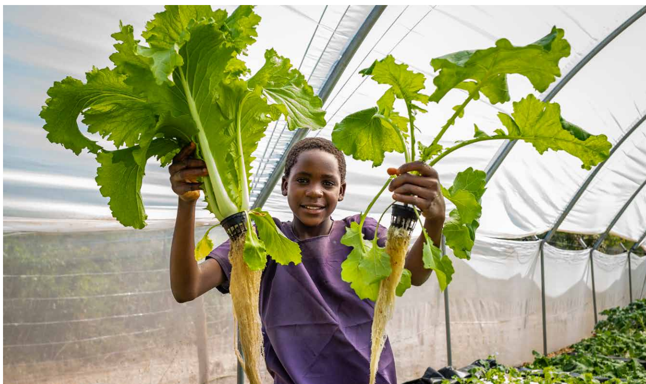
Crops produced in the hydroponic garden at Purity's school in Zambia are used for school meals and the surplus is sold to the community.