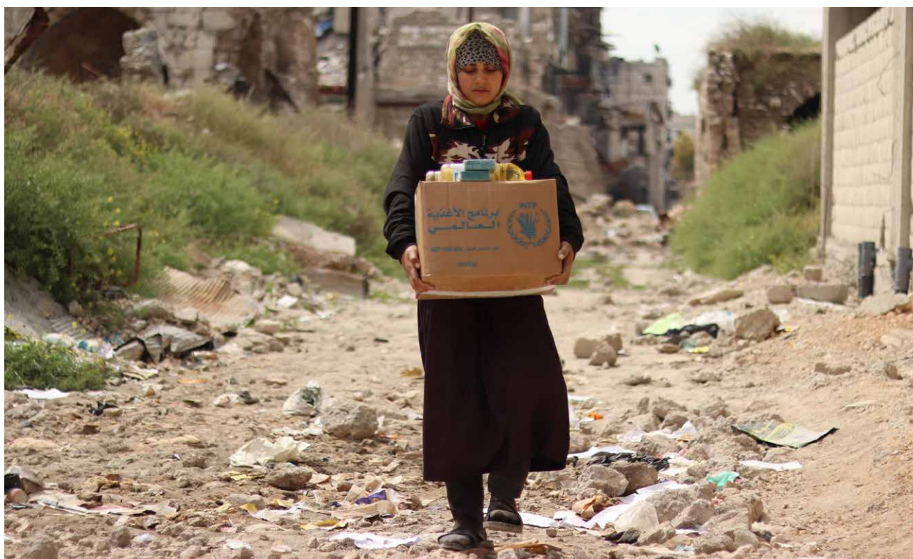
A woman carries supplies from a WFP distribution in Aleppo, Syria.

More than 80 percent of the food WFP purchases is bought from developing countries, with a focus on buying within the countries or regions where WFP operates, in order to support local economies, minimize transport costs and reduce environmental footprint.