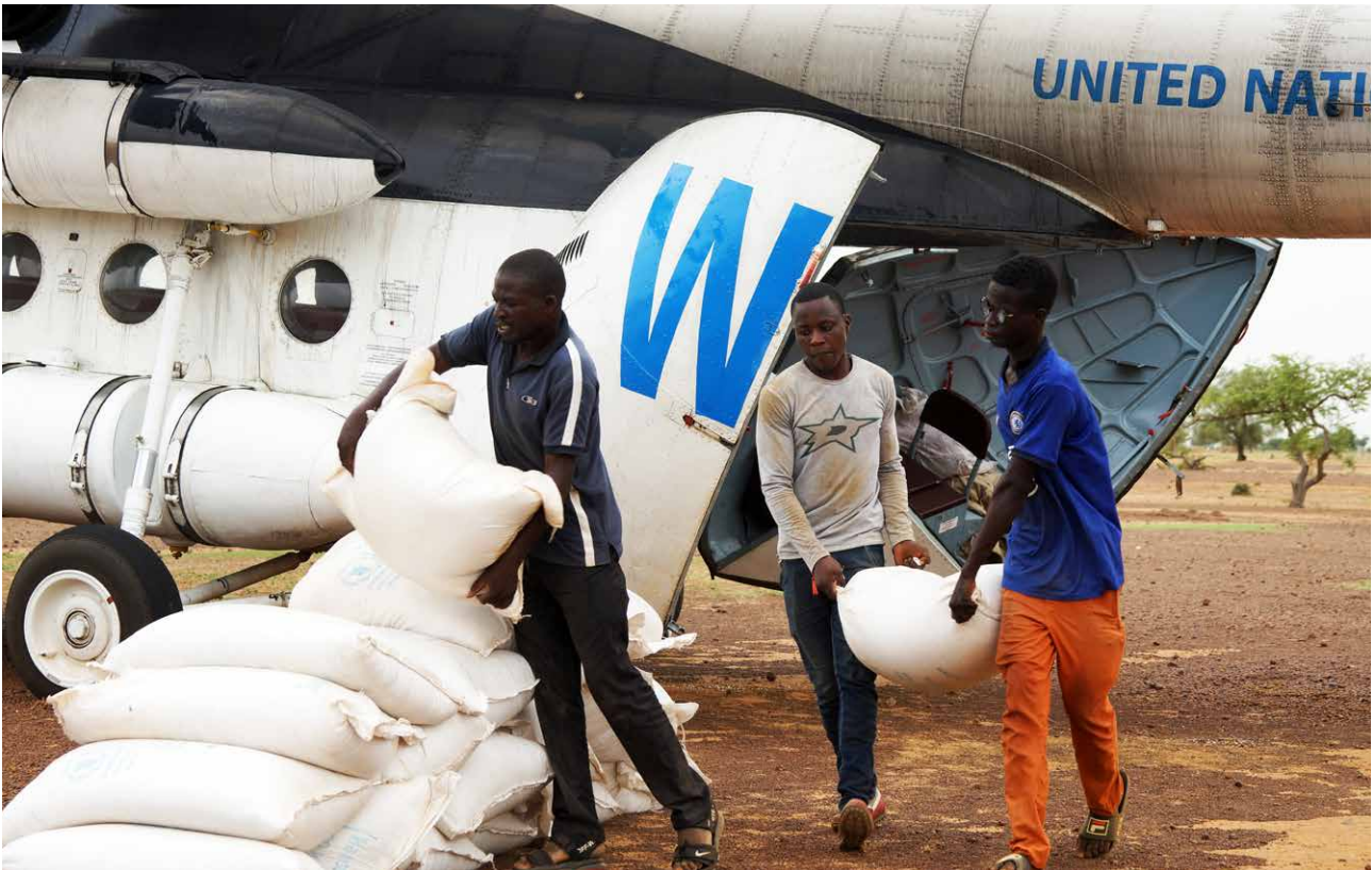
Food is unloaded from a WFP helicopter in Mansila, Burkina Faso.