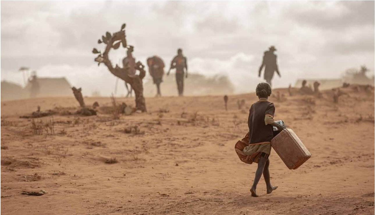
Southern Madagascar has been suffering from its most acute drought in four decades.