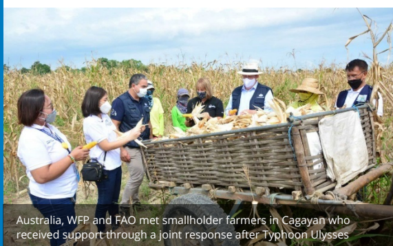
Australia, WFP and FAO met smallholder farmers in Cagayan who received support through a joint response after Typhoon Ulysses