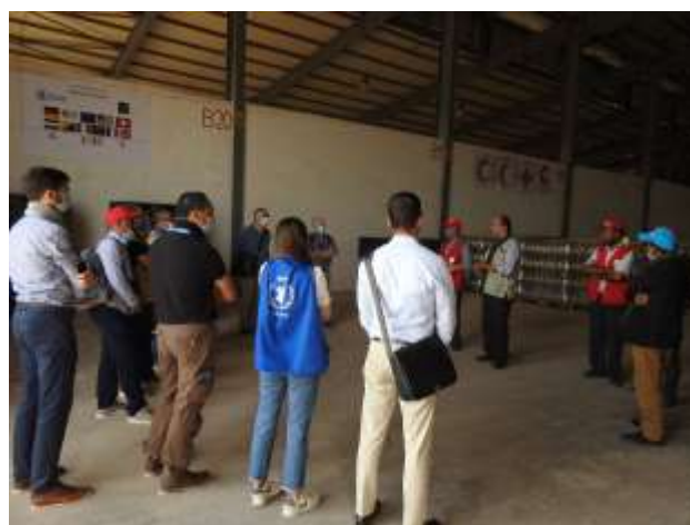
Photo caption: The donors mission’s participants visiting the WFP warehouse.

After two years of absence due to Covid-19 pandemic, a large donors’ mission took place over the last week of October, with the participation of almost 40 delegates. The programme of the visit was organized jointly by the three humanitarian agencies present in the refugee camps (UNHCR, WFP and UNICEF) and it included most of WFP respective projects. A positive feedback was received from the participants as they praised the joint UN efforts (UNHCR-WFP-UNICEF) and the community-based approach adopted in all projects.