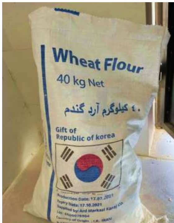
Photo caption: Since bread is a vital element of refugees' food basket, WFP Iran distributes fortified wheat flour in 20 settlements for 31,000 refugees (9kg per person) so that they can bake their own bread.

Japan, Germany, Republic of Korea, People's Republic of China, multilateral funds, and private sector donors.