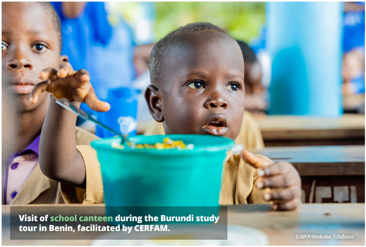
Visit of school canteen during the Burundi study tour in Benin, facilitated by CERFAM.