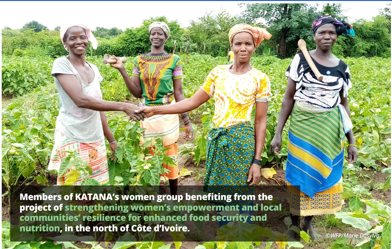
Members of KATANA's women group benefiting from the project of strengthening women's empowerment and local communities' resilience for enhanced food security and nutrition , in the north of Côte d'Ivoire.