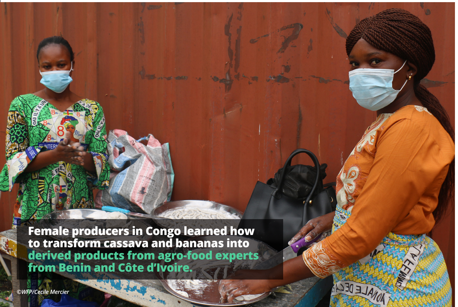
Female producers in Congo learned how to transform cassava and bananas into derived products from agro-food experts from Benin and Côte d'Ivoire.

The practice should not be complex, so target groups can quickly and easily understand and benefit from it. Different factors, including human, financial, and environmental factors, should be considered and addressed to ensure the practice is technically feasible. The good practice should be easy to learn and to implement.