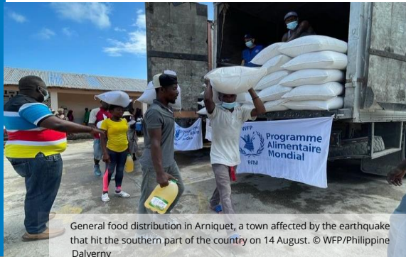
General food distribution in Arniquet, a town affected by the earthquake that hit the southern part of the country on 14 August.