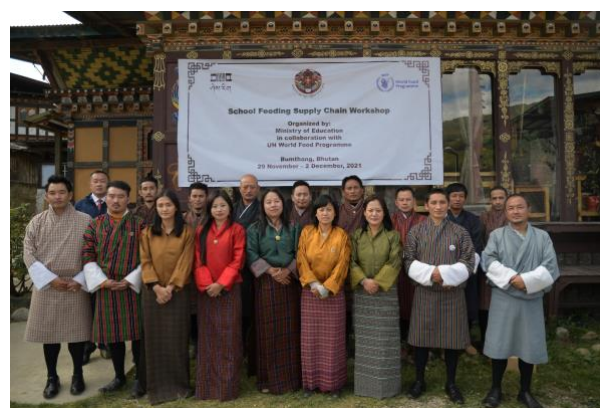
Photo Page 1: Workshop on PLUS Schools Menu, Haa District