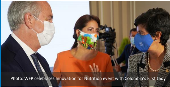
Photo: WFP celebrates Innovation for Nutrition event with Colombia's First Lady